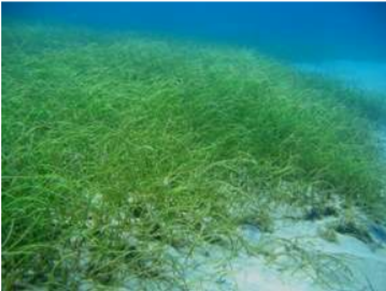
Syringodium filiforme -native species