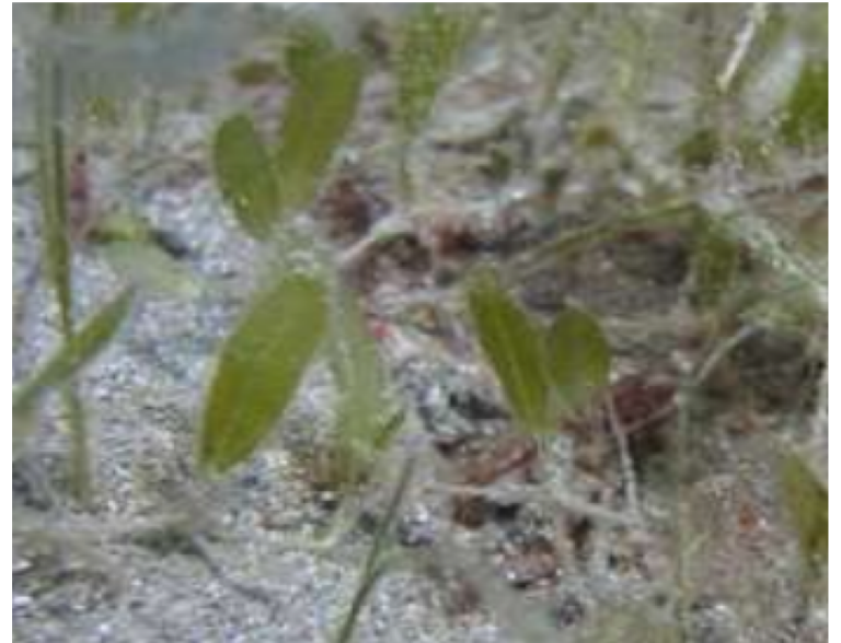
Halophila stipulacea -invasive species